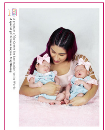
– Postcard Participants

We thank CDCR, CCHCS, and participating institutions for their continued support and partnership in creating pathways to family connection, support, and hope. As soon as in-person visits resume, our buses will start rolling again! We look forward to welcoming families to “get on the bus” sometime soon.